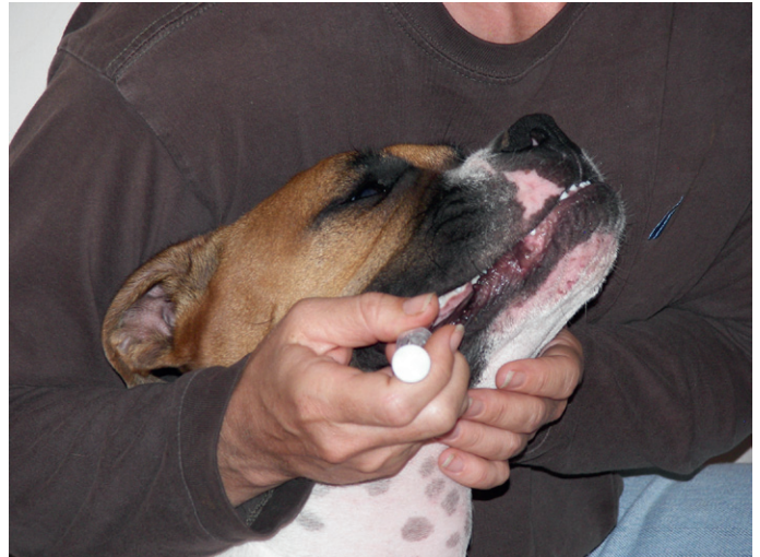
Oral syringe (in right hand) is slipped into the cheek pouch at the corner of the dog’s lips, while the head is held slightly elevated (left hand).